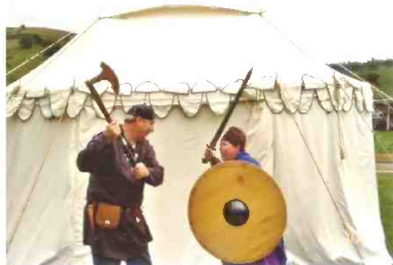
Viking diplomacy at work.

As a special treat this year's event will include the Vikings of Bjornstad who will give an insight to our Viking heritage with displays, memorabilia and their "Viking Art of War" presentation, a 15 to 20-minute demonstration of Viking age weapons and tactics. www.vikingsofbjornstad.com/